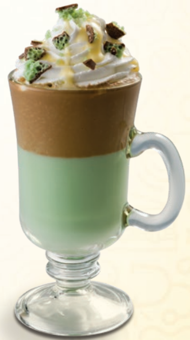
AERO® PEPPERMINT LATTE