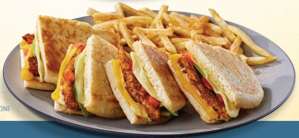
CAJUN CHICKEN TRAMEZZINI